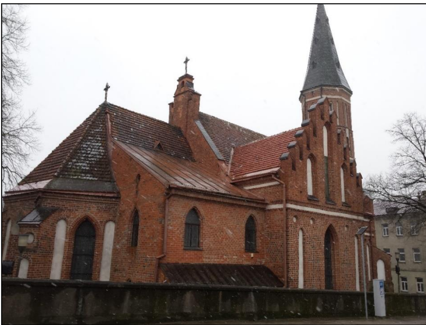
Figure. 3. Church of Blessed Virgin Mary's Assumption into heaven (Vytautas Magnus church).

Wooden church (Figure 4) of St. Michael Archangel in located in Rumsiskes town, which was built in the 18 th century. Church has characteristic ethnic architectural elements. Church has natural ventilation and local heating. Six electrical radiant heaters are used for the heating; they are switched on 5 – 10 min. before the mass.