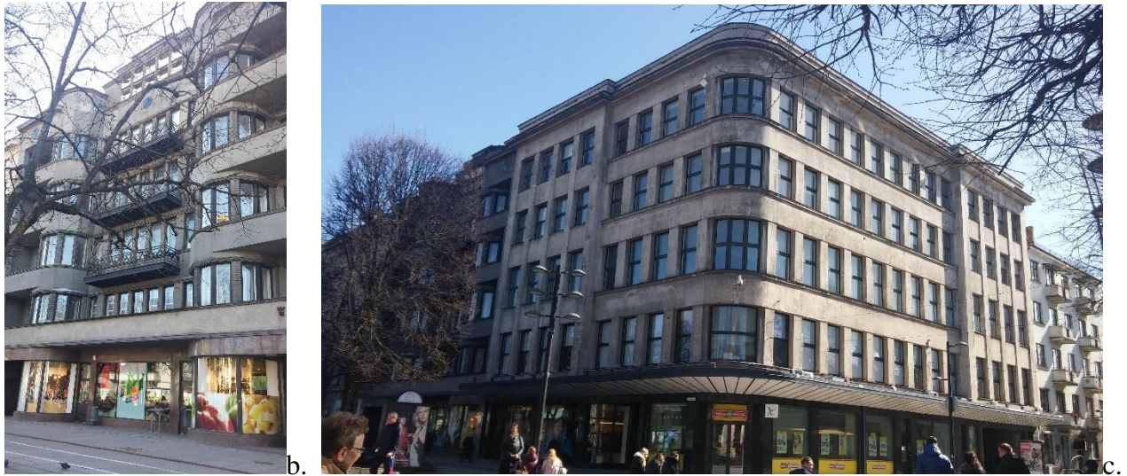
Figure 2. Buildings of Kaunas inter-war modernism a. The Central Post Office; b. The former office of “Pazanga” company; c. The former headquarter of milk processing company.

The potential source of knowledge. The buildings from different historical periods can be found in the historic center of Limassol. Historic churches, mosques, industrial buildings (including wineries), and theatres often cluster in the same area, colonial buildings that were built during the British occupation of the island are present there as well. Until recently the majority of these buildings were in poor condition. All the historic buildings in the center of Limassol have been named as “Ancient Monuments” under the Antiquities Law and since 1982 almost all of the traditional buildings in the historic center have been declared as “Listed” in accordance with the Town and Country Planning Law (Philokyprou, 2014).