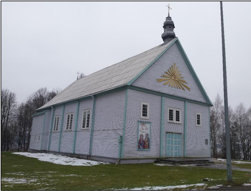
Figure 4. St. Michael Archangel church of Rumsiskes.

For the measurements of temperature and relative humidity, HOBO sensors were used. Sensors were attached to the stand at 0.1 m, 0.6 m, 1.1 m, and 1.7 m height, to check temperature differences above the floor for standing person, for seated person and for the ankle level. One stand with HOBO sensors was placed in the middle of Rumsiskes church. Two stands (near altar stand Nr. 1 and in the middle of the church stand Nr. 2) were placed in Vytautas Magnus church. The additional 5 sensors were placed in critical places – in the balcony, near the organ instrument.