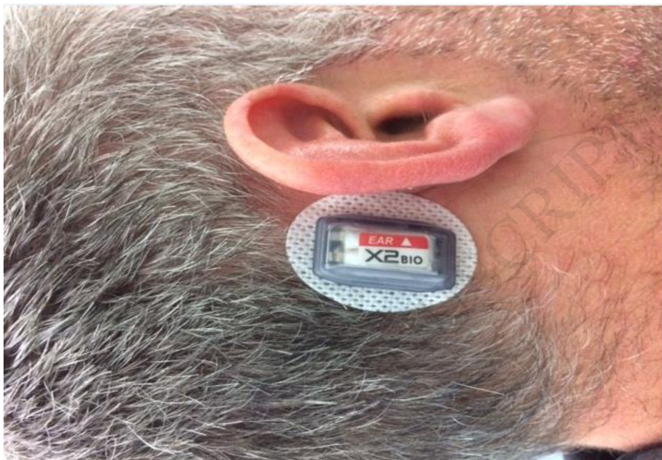
Figure 1. Xpatch Accelerometer sensor placement.