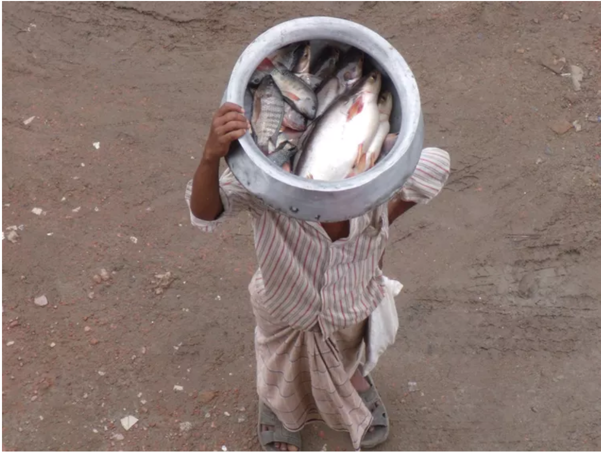
Mobile vendor selling affordable fish in Bangladesh.