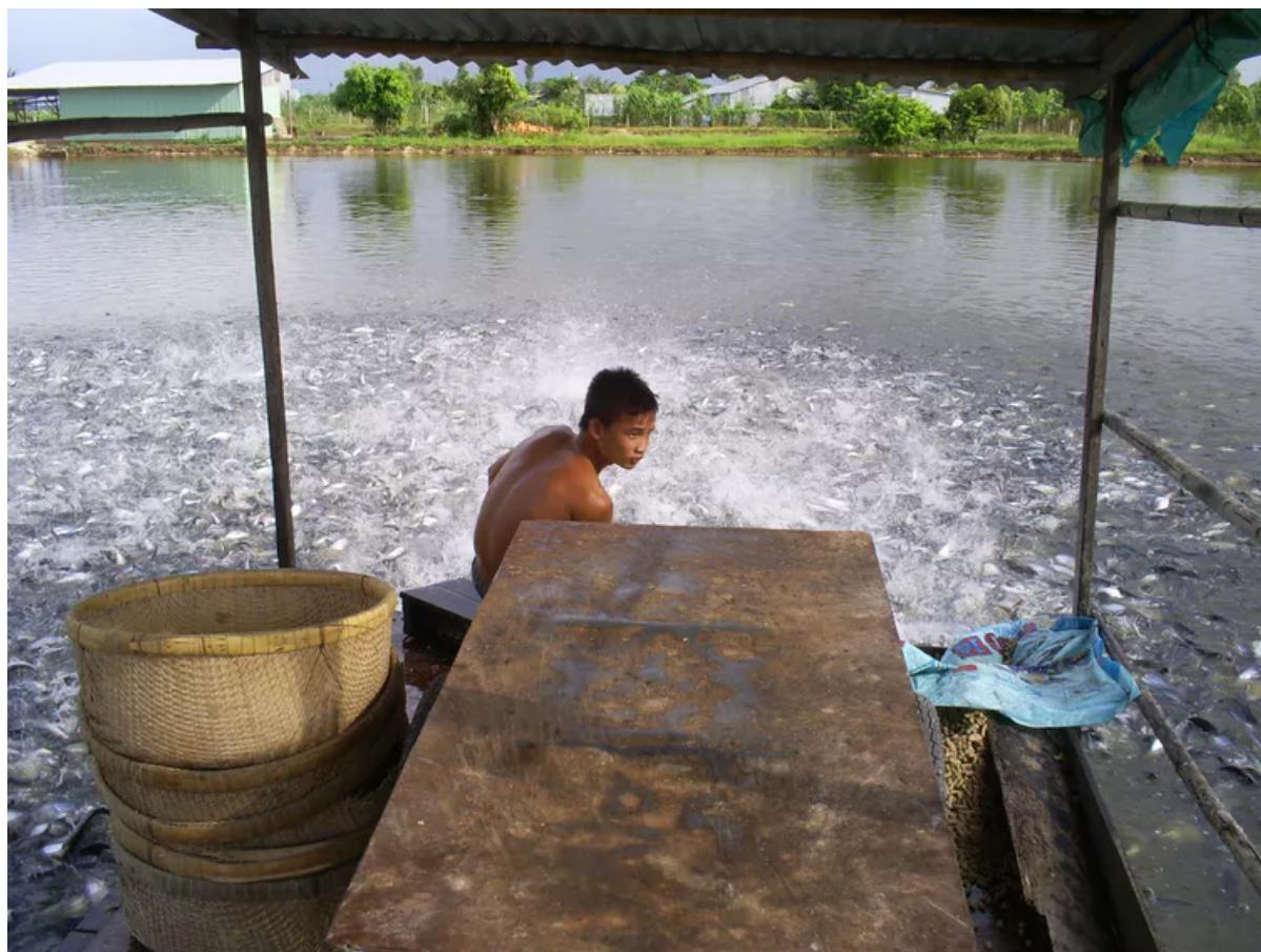
Farming pangasius catfish for export in Vietnam.