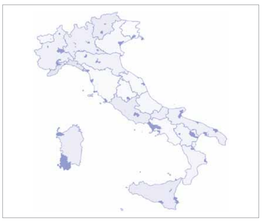
Fig. 1 Sites of National Interest for the Remediation (SIN)/Italian Polluted Sites (IPS)

The public's environmental concern has begun to take a new level of importance in Italy and the willingness of several grassroots organizations, activists, NGOs and local communities to react against local environmental risk represents a significant shift in the public perception of the environment. Events such as the outcome of the Seveso tragedy that occurred in Lombardy in 1976, the industrial petrochemical pole of Melilli-Priolo-Augusta, Gela and