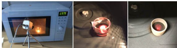
Figure 1: Microwave sintering using a kitchen microwave

Microwave sintering: Microwave sintering of lunar regolith as a potential fabrication method of lunar habitat construction has become one of the popular topics in recent years [1]. Previous research in this area, however, have been conducted using domestic microwaves. Figure 1 shows our initial work setting (see companion abstract by Levin-Prabhu et al. in this meeting).