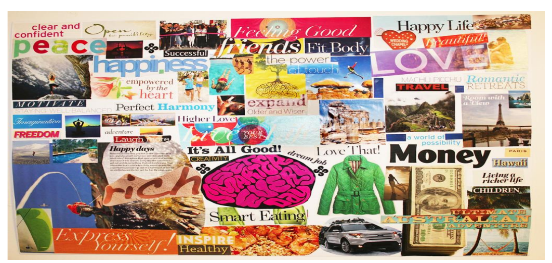
Figure 4.2. The visual image of a "vision board"<sup>7</sup>

There was an exercise like attaching the visual images of the things you like to do or making you feel good and also of your dreams to a board. For instance say, I like reading very much, then, I have an image of a book to put on the board. Then, because it is in front of you, you feel excited whenever you see it during the day. There is no need to make an extra effort to do something. In reality, it depends on the person. I looked at my vision board and then, I talked with my coach and suddenly I discovered that my favorite thing is to write and I started writing. (Neriman, 38, Housewife)