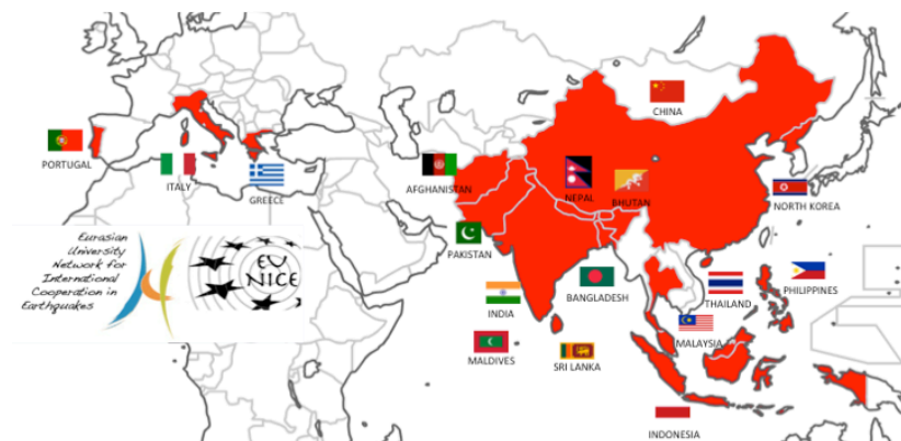
Fig. 1: Asia-Europe Partnership and eligible incoming Asian scholars countries for the 100+ mobility flow over the 2010-14 project implementation

members who make up more than 34,000 Rotary clubs in nearly every country in the world and share a dedication to the ideal of Service Above Self.