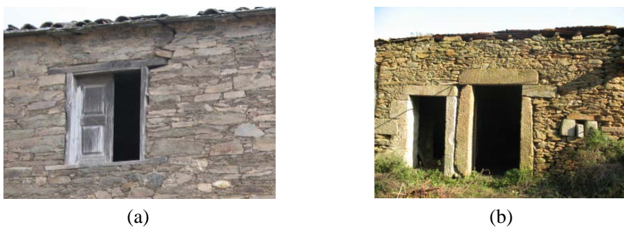
Figure 7 – Lintels: (a) Timber; (b) Granite.

Taking into account the loads carried by the door and window lintels, as well as its typical span, and the limited masonry tensile strength, usually were adopted elements made of other materials. In Trás-os-Montes and Beiras regions these elements were usually made of timber, see Figure 7a, while in the Minho region these elements were mostly made of large granite stones, see Figure 7b.