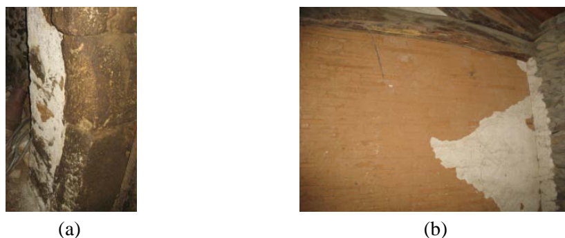
Figure 4 – Interior partition walls: (a) Schist with granite; (b) “Tabique”.

Masonry corners play an important role in the building structural performance, since on one hand they ensure the connection between perpendicular walls. But, on the other hand, these elements in masonry structures tends to concentrate larger stresses, due to the horizontal loadings induced by wind and earthquakes, as well as the resulting thrust from the roof structure. The quality of the materials and its arrangements in the corners is even more important for buildings with multi-leaf walls, considering that for these cases the quality of the masonry is lower, as stated before, due to the smaller dimensions and poor mechanical properties of the stone units.