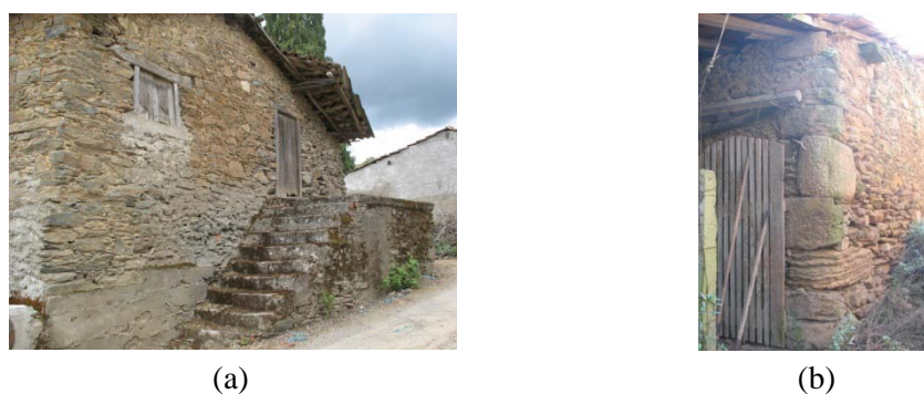
Figure 5 – Building corners: (a) Schist; (b) Granite.

In the Trás-os-Montes and Beiras regions, where it was common to build walls composed of two leaves, the corners were typically made with larger schist stones, see Figure 5a, or combining schist blocks with quartzite. In the Minho region, the corners were made in schist units of larger dimensions, because extracting larger schist blocks at this region was easier, or in some cases can also be found granite, see Figure 5b.