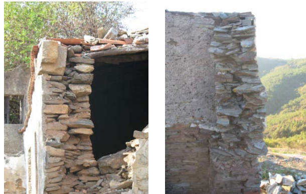
Figure 2 – Two leaves walls without connection.

usually simple. When it is not possible to extract larger schist stones, the walls can present two leaves, see Figure 2, as is the case of many buildings in Portugal. In these cases, the schist stones are neatly arranged and the binding mortar is usually made of earth. In this type of schist fabric, wood or stone connectors can be found. They play a fundamental role for the monolithic behaviour of the masonry walls.