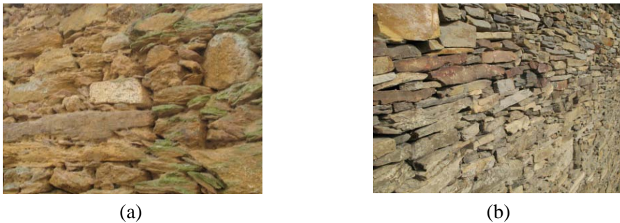
Figure 3 – Joint in schist masonry: (a) With earth mortar; (b) Without mortar.

An aspect varying considerably in the different types of schist masonry in Portugal is the presence or absence of mortar connecting the schist stones, see examples Figure 3. In existing walls, different types of mortar connecting the schist stones can be found, such as lime or simple earth mortar. But, it can be also found masonry schist walls without mortar, for which the meticulous settlement of the schist provide imbrications which ensures the adequate mechanical behaviour of these walls.