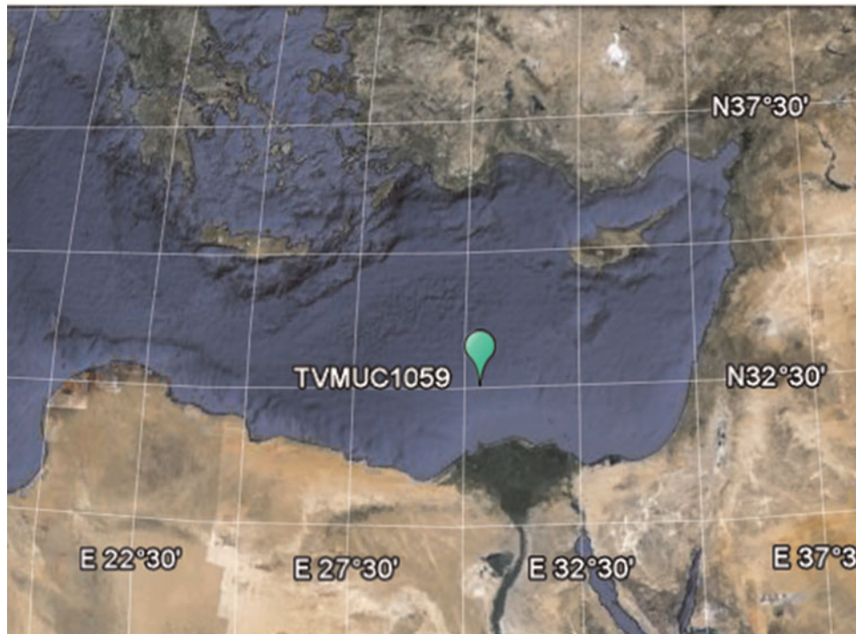
Fig. 1. Map of the study area.

ligament was opisthodontic, internal, and attached to chondrophore (Figure 2). A reduced digestive tract was also visible.