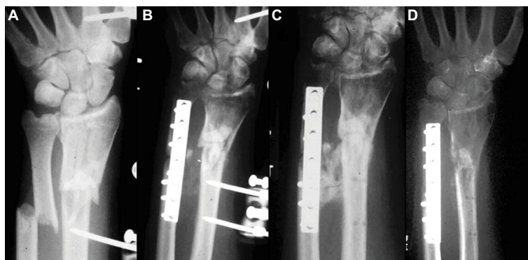
Figure 2 (A) Patient sustained open fractures of both bones and was placed in an external fixator; (B) early formation of synostosis; (C) fully mature synostosis; and (D) after successful excision of the synostosis.