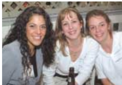
Lasting friendship captured at the AOTA party.

Alumni Association was ready on April 20, 2001, to host a Reception for OT Alumni at the historic Reading Terminal Market. Nearly 300 OT alumni, faculty, students and visiting guests were treated to a wonderful venue with antique railroad luggage carts laden with selections of cheeses, crudite and dips, as well as cheerful waiters circulating the crowd with specialties provided by different Market vendors. Remembering old times and sharing new ones was a priority as partygoers stayed past the 7-9 pm event and enjoyed the Market piano player well into the evening.