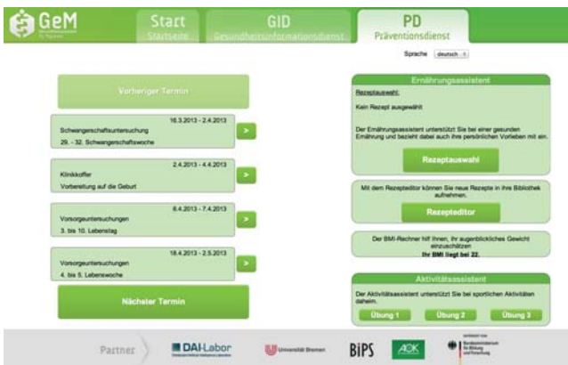
Fig. 3: Calendar view (left) and access panels to the nutrition and activity assistant (right) of the prevention service.

The prevention service, PS, consists of two subsystems focusing on nutrition and activity support for people. Figure 3 shows the start screen of the PS. On the left hand side of the GUI is a calendar view that lists appointments (e.g., medical treatments, gym classes) that a user should be aware of. On the right hand side of the GUI, the user has access to a nutrition assistant and an activity assistant that form part of the PS. Both services are described in the remainder of this section.