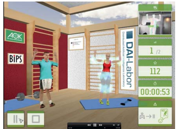
Fig. 4: Activity Assistant: The user, shown in the upper right corner, is captured by the XBOX Kinect 3D camera and should follow the exercises of the trainer (left).

2) Activity Assistant: The activity assistant intends to defeat one's weaker self. By using game mechanics and rewards, people are motivated to do physical exercises at home [3]. As shown in Figure 4, users see a digital trainer who demonstrates an exercise (e.g., Jumping Jacks) that should be imitated by them. Users' motions are tracked using a XBOX Kinect 3D camera and compared to the instructed movements. For each activity, the users can earn activity points. The more exercises the users perform, the more activity points they earn. These points are directly fed into the nutrition assistant, i.e., the food suggestion depends on the users' individual energy expenditure.