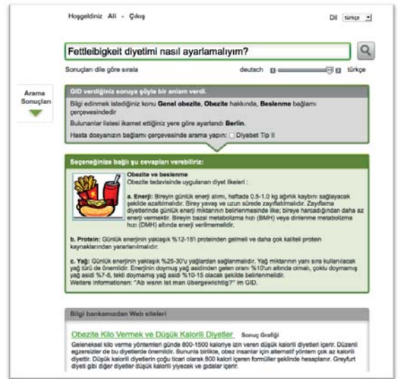
Fig. 1: Results view of the HIS search interface.

The HIS information service provides a classical search interface that accepts polyglot search queries. Users can enter queries using one or more languages. A user can for instance enter “Fettleibigkeit diyetimi nasıl ayarlamalıyım?” (Translation: “How should I arrange my diet in obesity?”), combining German and Turkish languages, respectively. HIS processes the query and matches the terms of the query to a health ontology. Based on the matched query terms, results are retrieved using a graph-based search method. Search results can be services from health insurances, websites with tips for healthy living or places nearby, e.g. fitness courses in local gyms. Figure 1 shows a screenshot of the HIS GUI where search results to a given query are displayed. The grey box under the search field shows the concepts from the ontology that have been identified in the search query. Underneath it, in the green box, relevant information is displayed. In addition, a list of results for further reading is presented.