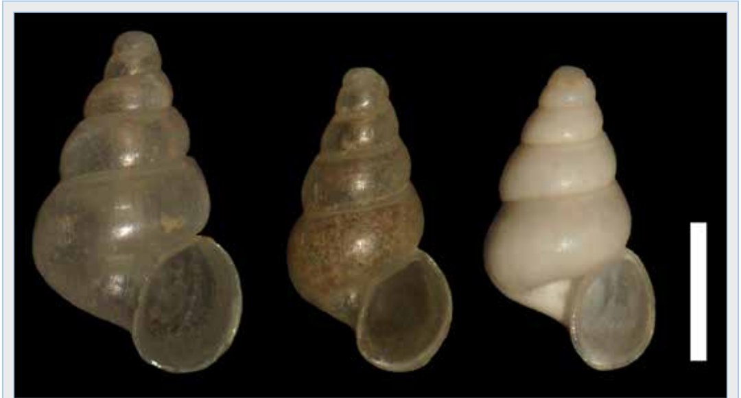
FIGURE 2. Palaospeum lopezsoriano sp. nov. from Fuente del Hambre (type locality). Scale 1 mm.