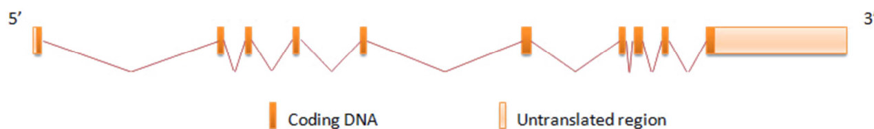
Schematic diagram of PTGIS genomic region.