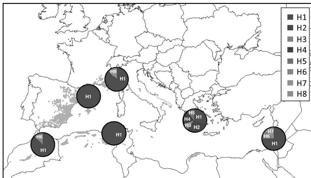
Fig. 2: Haplotype distribution of the candidate gene dhnl1 superimposed on the distribution map of P. halepensis . Notice the low diversity for this gene in the western area.

Higher levels of nucleotide diversity in candidate genes for drought response were present in P. pinaster than in P. halepensis , despite its narrower range in the Mediterranean. Differences across species were also reflected in the haplotype distribution for each tree species, with P. pinaster showing many different haplotypes at similar frequencies and P. halepensis showing fewer haplotypes with only one that is common or even fixed. The low levels of nucleotide diversity in Aleppo pine are more noticeable in its western distribution (see Figure 1 and GRIVET et al. 2009) where most genes were fixed or almost fixed for particular haplotypes (Figure 2), a probable consequence of long-range colonization of the Western Mediterranean from ancient Aleppo pine populations in Greece and Turkey and a more acute impact of the Ice Ages in this range of the species. Molecular analyses also revealed intense and relatively recent bottlenecks in Aleppo pine as well as a time of split between North-African and Iberian populations of the species well predating the Last Glacial Maximum albeit not as old as the one estimated for maritime pine (JARAMILLO-CORREA et al. 2010). In contrast, maritime pine seems to harbor large amounts of diversity for these genes due to a more stable demography; in addition, because of its more mesic distribution, higher environmental heterogeneity (from xeric to humid) would have resulted in