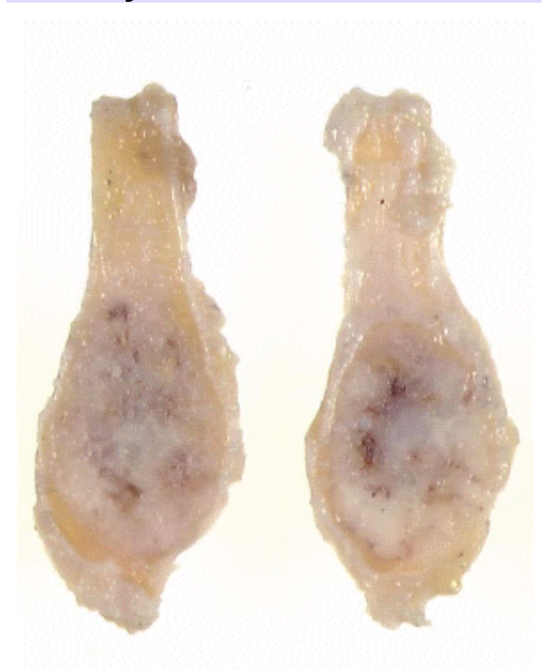
Figure 1: En bloc resection specimen of the proximal fibula of a 43 year old female, containing a lobulated bluish white, translucent tumour ( 4.5 \times 2 \times 1.9 \text{ cm} ) located centrally within the medullary cavity, consistent with central chondrosarcoma.