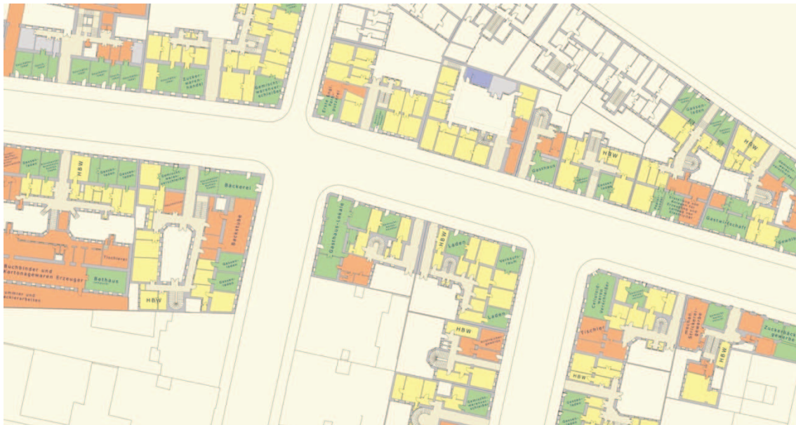
Fig 4. UPM showing the use structure analysis for historic status – around 1910.

The information of the afore mentioned house biographies is being processed by including the various use categorizations of all single ground floor premises and by utilizing a special colour code: green representing semi-public use (with high use frequency and direct connection to the public street space); orange : production, yellow : living, grey : storage and blue : garages. The Revit® tool “Rooms” is used to mark this reference within the building model based on room-bounding elements. Thus, the model offers highly detailed, multi-dimensional information. Which also explains why throughout the development of the methodology data managing had become a number one feature.