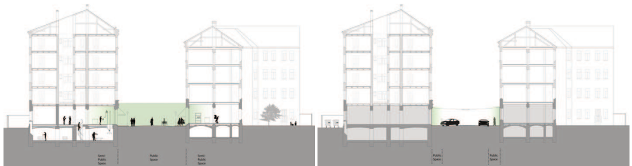
Fig 6. Section views of the StadtParterre of the 1910-status and the current status; while the historic StadtParterre functioned as a uniform, inter-connected structure, the exchange between the various zones is no longer given today. © Kodydek/Psenner 2018