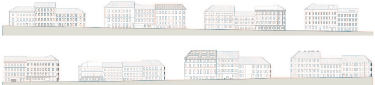
Fig 5. UPM used in teaching: a street in an outer district (still a Gründerzeit area) was being modelled by master students and consequently analysed according to various research questions. Here the UPM perfectly reflects the slope und thus incorporates a possible topographical approach

Accordingly, two more streets are being investigated with in the research project-both situated in outer Gründerzeit districts: one measuring 269 meters and including 24 houses and the second one measuring 327 meters and including 30 houses.