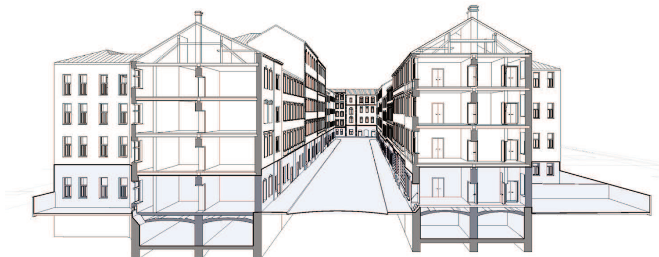
Fig. 1: The Urban Parterre Model.