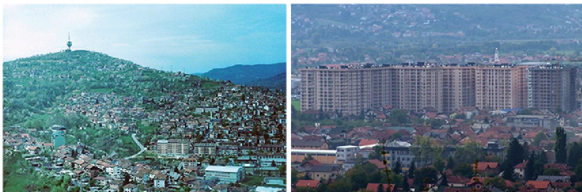
Fig. 4: Uncontrolled settlement development in Sarajevo (Uruči, 2017)

After the Bosnian war in the 1990s, the sociopolitical and spatial development opportunities of Sarajevo have become more complex and limited by the new administrative structure and the division of the city settlement area in local, cantonal and entity units (Korijenić, 2015). On the other hand, Sarajevo continued to attract new population as a capital city, which it has become after the war. Population migrations have accelerated the transformation process of the city and its uncontrolled settlement area growth, which negatively affected its net of infrastructure, as well as, the city's image and its quality of living (Fig. 4) (Arhiv Zavoda za planiranje razvoja Kantona Sarajevo, 2015) (Uruči, 2017).