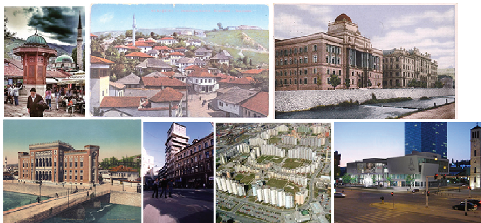
Fig. 2: Reading Sarajevo's development history along the valley (Tabori, 2017)

Sarajevo, as a part of former Austro-Hungarian Monarchy, got its first Building Code in 1880 (Fig. 3), followed by a second Building Code in 1893. Ever since then, the Building Code Document is missing in Sarajevo's spatial regulative, which resulted in unclear building procedures and urban "cacophony". In 1932, there was an attempt to make a unified Building Code for all cities in former Kingdom of Yugoslavia, but it failed. The last valid Building Code for Sarajevo was from Austro-Hungarian period, which was set at the same time as in Vienna. For the comparison, since then Vienna has novelized its Building Code about 60 times, sometimes four times per year (Geuder, 2016).