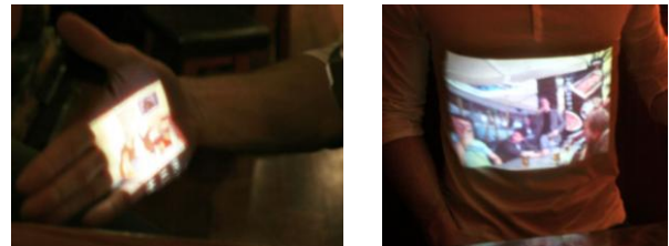
Figure 2. Projecting pictures in a bar using alternative projection surfaces.

instantly started projecting images on the wall. He did this with a huge smile on his face and commented “Cool, I want one for Christmas”. During the evening of the second day of the trial we spent several hours in one of the many student bars at Lancaster University, Figure 2. During the evening the location was heavily populated by students. The idea of projecting content in bars and clubs with friends was very appealing, “I would do it all day” and “Good idea in a bar with mates” were some comments expressed.