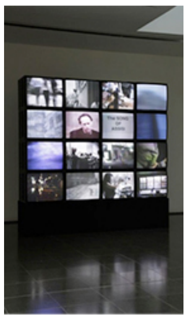
Figure 4: Lavender Piece (2012) 16mm film transferred to video, various dates, each film 5–15min Installation view, Jonas Mekas, Serpentine Gallery, London

All the objects displayed—such as the filmmaker's technical equipment, notes, poems, sheets and the Anthology Film Archive banner designed in 1970 for the Archive's opening that resembles the flag of a new country—and all the heterogeneous materials shown are evidence of a particular memory: traces of a life. An installation of a set of sixteen monitors titled Lavender Piece (2012) simultaneously displays all Mekas's different 16mm films. Views of streets, snow, people, portraits of the filmmaker are mixed without a narrative theme or a chronological order, evoking an instantaneous self-portrait of the artist, composed of glimpses selected by his gaze, rather than images of his body. The flow of images and sounds comprise the exhibition and somehow become indistinguishable, forming fragments of an entire, unique project.