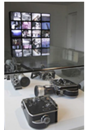
Figure 3: Bolex cameras owned by Mekas Installation view, Jonas Mekas, Serpentine Gallery, London

Originally, he intended his footage as exercises, or preparatory notes for a film to be made; as we read in "The Diary Film":