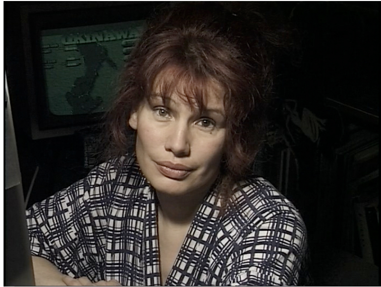
Figure 7: Level Five (Chris Marker, 1997). Optimum Home Entertainment, 2011. Screenshot.