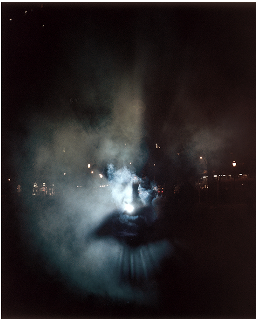
Figure 1: Tony Oursler, The Influence Machine , 2000–2002. Video projections. Madison Square Park, New York / Soho Square, London / Magasin 3, Stockholm. Photograph: Tony Oursler.

Raymond Bellour, Director of Research Emeritus at C.N.R.S., Paris