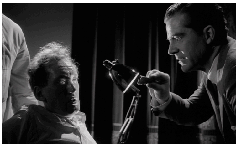
Figure 6: Night of the Demon (Jacques Tourneur, 1957). Mediumrare, 2010. Screenshot.