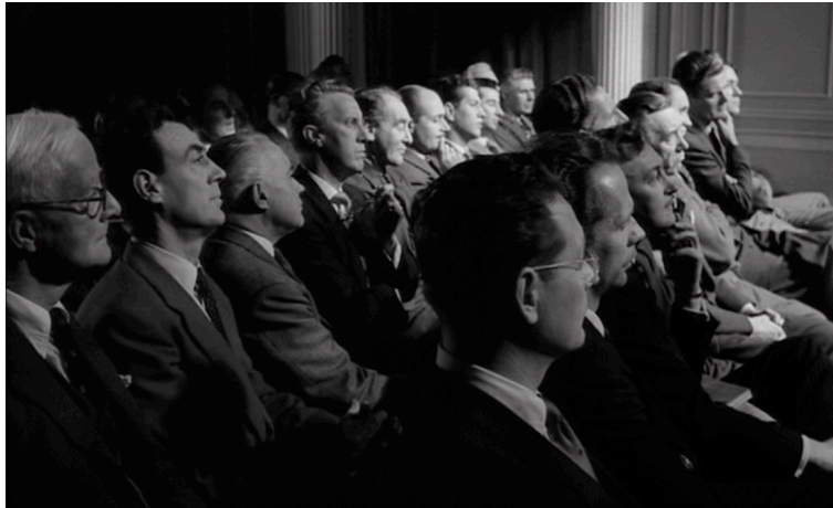
Figure 5: Night of the Demon (Jacques Tourneur, 1957). Mediumrare, 2010. Screenshot.

[Projection: Public hypnosis and auto-defenestration scene, 7']