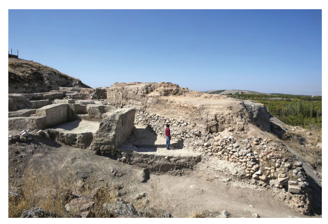
Figure 3. Arslantepe, facing west. Sector G3 with the twelfth- to eleventh-century BC monumental town wall and the 'green building'.

Two figurative bas-reliefs—which might have decorated a city-gate—had been discovered in 2010, and were sealed by the destruction that marked the end of the Early Iron Age settlement at the beginning of the tenth century BC (Manuelli & Mori 2016: 219–22). The 2016 excavations demonstrated that the fortification wall had a total preserved height of nearly 4m, thus stressing its impressive monumentality.