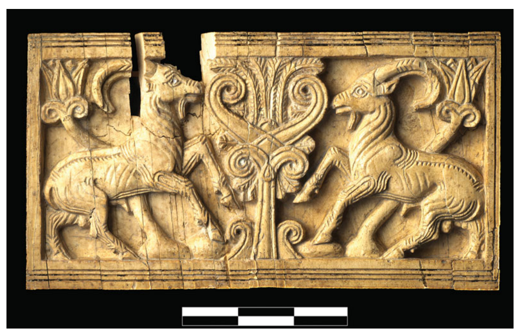
Figure 5. The ivory plaque.