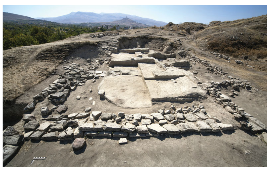
Figure 6. Arslantepe, facing south. The large neo-Hittite monumental hall in the centre of the town.