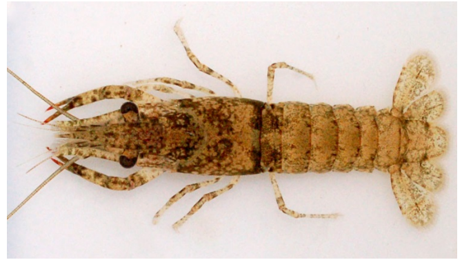
Figure 2. The Shrimp Crayfish, Faxonius lancifer , from S of Crossett, Ashley County, Arkansas.

Faxonius lancifer is readily recognized in the field by its reddish-brown to gray body coloration thickly dusted with darker specks giving it a somewhat mottled appearance, the short, narrow chelae (dactyl shorter than the length of the palm lacking longitudinal ridges and tubercles), and an acumen that is longer than the rest of the dorsum (Fig. 2). The carapace has strong cervical spines and the carapace and abdomen are about equal in length. The rostrum of F. lancifer is wide with a deep, central, trough-like depression and lateral spines and branchiostegal spines are absent. The areola is absent and the antennal scale is widest at the point anterior to mid-length. Adults rarely exceed 76 mm total length (TL) (Morehouse and Tobler 2013). The first pleopod of Form I males terminates in 2 very short processes while the mesial process is noncorneous and equal in length or slightly longer than the central projection. Pflieger (1996, Plate 14) provided line drawings of