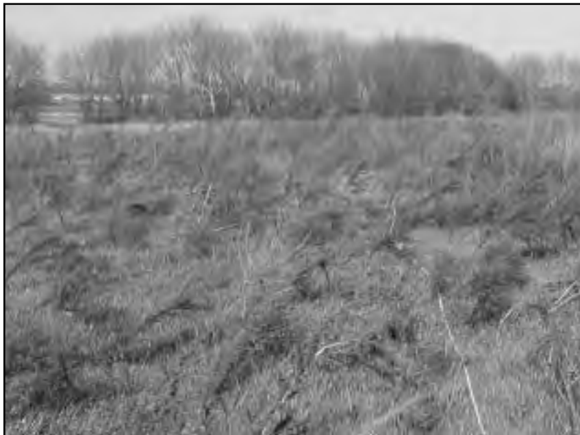
Fig. 1. Native tallgrass prairie (A) and previously cultivated agricultural (B) land uses at the Chesney Prairie Natural Area near Siloam Springs in Benton County, Ark.