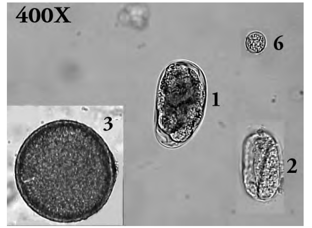
Fig. 1c. Parasitic eggs from skunk, fecal flotation.