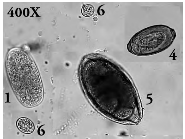
Fig. 1a. Parasitic eggs from opossum, fecal flotation.