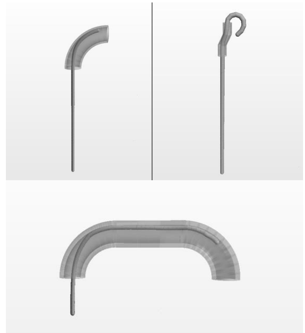
Figure 3. Performance of the simulated endoscope model in three different scenarios.

For creating an accurate and realistic training platform, navigation through a three dimensional ureterorenal model was implemented. The 3D model was previously acquired with a CT scan on a real urinary tract.