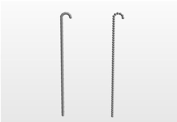
Figure 2. On the left, the continuous flexible endoscope model; on the right, its discretization.

In order to simulate the flexible endoscope, the solid model was discretized in a finite number of solid elements (spherical nodes), as depicted in Figure 2.