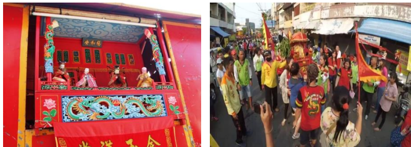
(a) Puppet Potehi

Chinatown society still upholds the existing customs. For example carnival Great Sam Poo and Small Sam Poo are regularly held every year. In addition there are many more forms of art and festivals also more powerful with Chinese customs such as plays Min Cicih, Puppet Potehi and others.