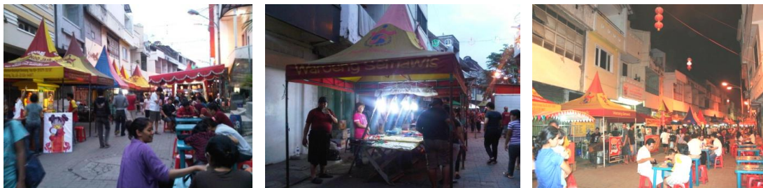
Figure 7. Activities of Waroeng Semawis in Gang Warung, Source: Observation, 2014, 2015

Chinatown area as part of the historical development of the city of Semarang also save heritage that should be preserved. There are two form of relics in the region, namely the physical and cultural heritage. The form of physical relics that still exist today is building nine temple. Preservation of the temples is done through the preservation and adaptation. Preservation is an effort to preserve a place like the original state without any change, including efforts to prevent the destruction.