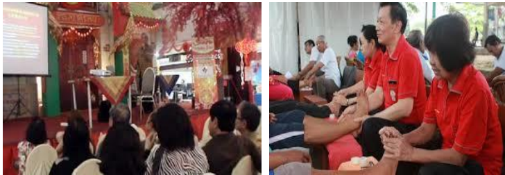
Figure 2. Social Activity, Source: Observation, 2014

Chinatown area directly adjacent to other ethnic groups, so that they interact with other groups. Their family ties are very close, because almost every time they meet. Communities in the area of Chinatown also often hold meetings as one form of social interaction. They have a special building for meetings. Through these meetings they can be mutual interaction and exchange of ideas. Already there are ethnic Chinese community organizations in Chinatown Semarang, the secretariat of the association Tjie Lam Tjay formed from the Foundation Tjie Lam Tjay, Kong Tik Soe and Kawu Khong Hwee.