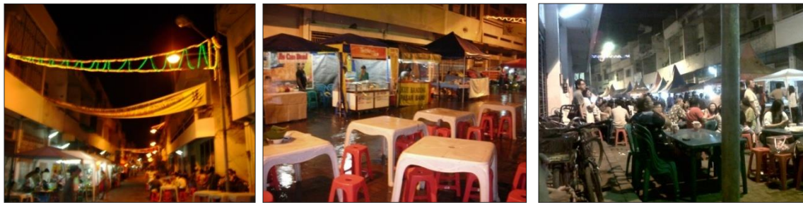
Figure 8. The Physical Condition of Waroeng Semawis in Gang Warung, Source: Observation, 2014, 2015

that should be preserved and developed. Using a temporary tent at the time, held every weekend, but the location of each stall is set up, because who sell at Waroeng Semawis are members already registered on the management of Kopi Semawis. Preservation of buildings along the Gang Warung should be done to support the activities of the culinary tourism, so the atmosphere can still be felt Chinatown visitors while visiting the site. Kopi Semawis also do repair facilities and infrastructure as the revitalization of Chinatown. These activities are carried out almost every year, but the timing could not be determined. Road maintenance is one of the regular activities are scheduled each year. Kopi Semawis itself is also trying to work with city government to carry out revitalization activities, although there is a little problem, because of the slow response.