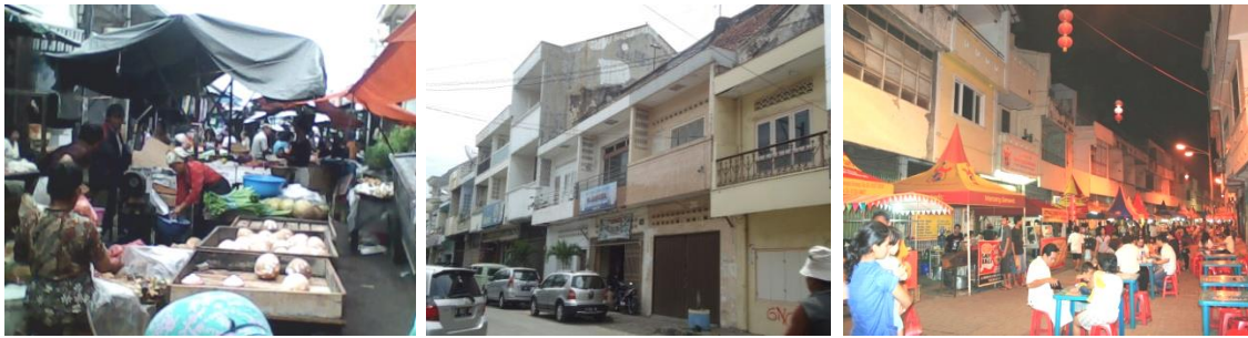
(a) Gang Baru Market