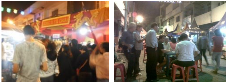
Figure 6. Waroeng Semawis in Gang Warung, Chinatown Semarang, Source: Observation, 2014, 2015

Goods sold include various souvenirs and clothes, various types of food and drinks, there are karaoke Semawis, also everything typical Chinatown which is the culinary center of Semarang. Starting from trading activities, social activities, cultural activities and culinary tour there in the shop this night, as a single entity to revitalize Chinatown. Settings booth and a dining table looks neat because it provided tents along the roads and in the middle row of tables and chairs that can be used by visitors to eat and relax. Sometimes the number of chairs and tables to the end of the number is limited, so visitors have to queue and stand even sit in front of the shop to enjoy the food, but this does not make visitors cured. There is also a row of chairs visitors who are not covered tents, so when the rain will be a problem for outdoor activities.