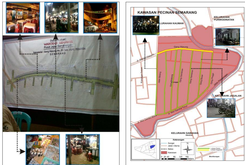
(a) Location of Traders at Waroeng Semawis

Waroeng Semawis as a culinary center that has been popular in Semarang and regularly held every weekend must be preserved. Development activities in the surrounding area also directed and limited to activities that support and do not deviate from its primary function as a trade area by preserving the cultural activities as cultural tourism potential in Chinatown.