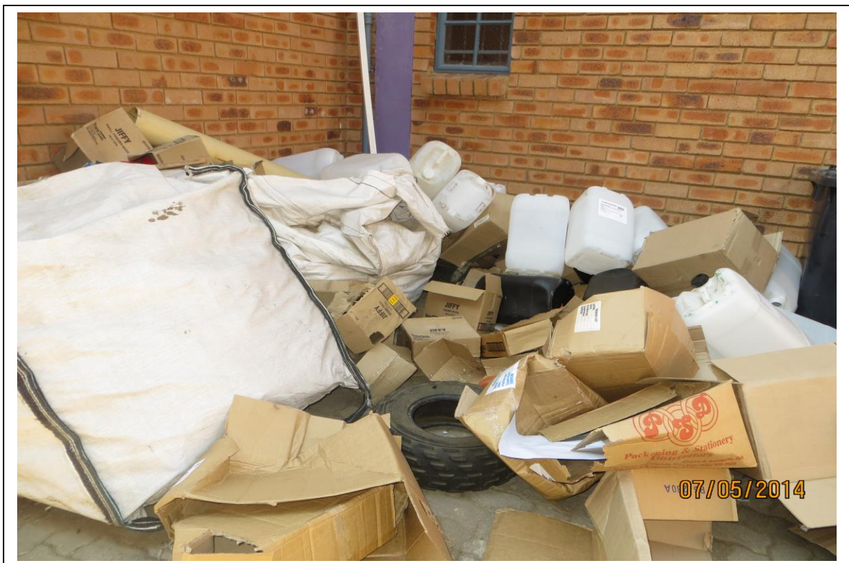
Figure: 6.2. An example of a recycling project at one of the schools involved in this study

“Colourful dustbins in all classes that are similar to the big dustbins outside, for learners to be able to separate trash” educator (AE#5).