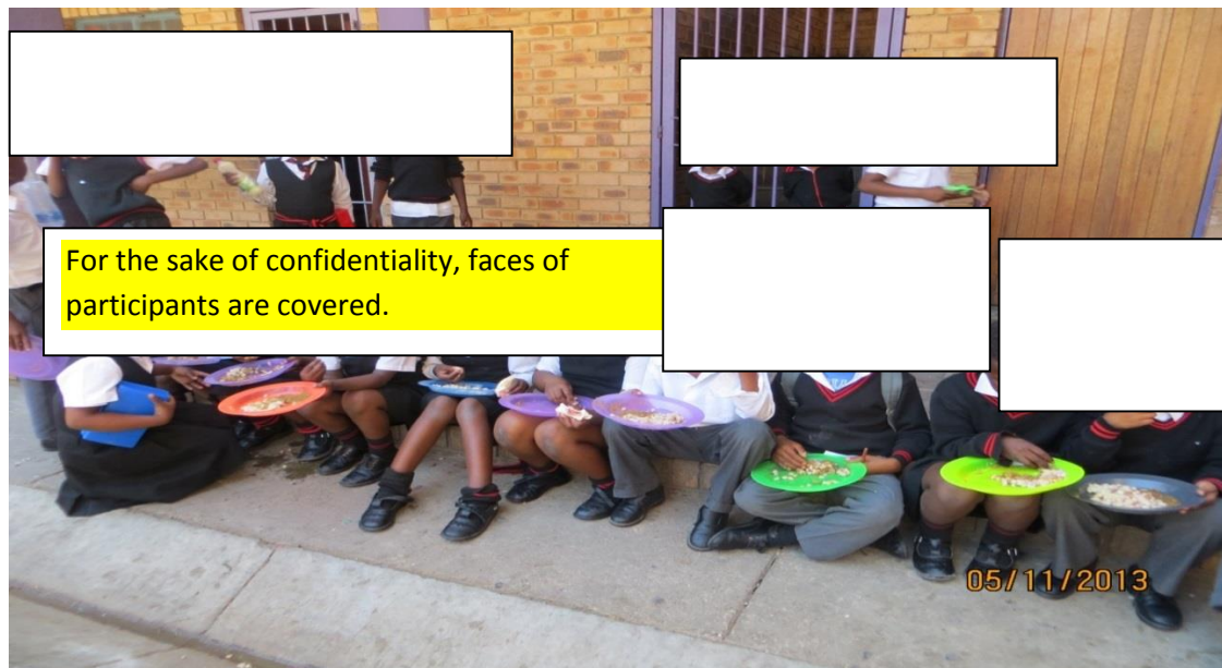
Figure: 6.4. An example of a feeding-scheme project at one of the schools involved in this study

There is a room for improvement in the implementation of the NSNP especially when it comes to promoting sustainability of the project in schools and meaningful collaboration with other stakeholders such as Tiger brands.