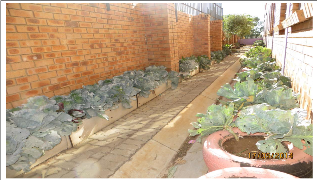
Figure: 6.1. An example of a vegetable garden at one of the schools involved in this study

Principals of the participating schools gave permission to the researcher to take pictures. Hence, these vegetable gardens EE projects in schools are supported by the photographic picture taken by researcher during participatory observation. See attached photograph (figure: 6.1).