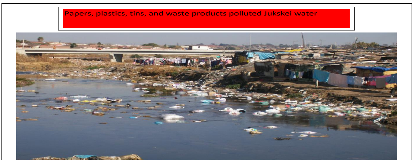
Figure 2.3: An example of highly water polluted Jukskei River in Stjwetla informal Settlement in Alexandra Township.

The below picture (Figure 2.3) depicts the level of contamination and the quality of water in the Jukskei River. Water from the river is used for washing clothes and bathing. The major source of bacterial pollution of the Jukskei River is inadequacy and extensive degradation of the sewer systems followed by indiscriminate dumping of waste in the river and its banks. The water quality is longer suitable for human consumption or the use of domestic purposes since it possess treats of health of all people. The existence of Stjwetla informal settlement makes it difficult even for the authorities to can able to manage or protect the river from being polluted.