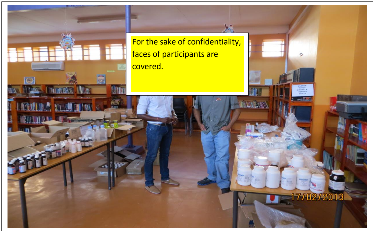
Figure 6.3: An example of an integrated school health project at one of the schools involved in this study

The above picture was taken during participatory observation as evidence of this unique and most needed EE project in Alexandra (cf. chapter 2: contextual understanding of Alexandra Township). Most learners were identified with problems of sight, and hearing. This type of project could not be related to any other country, since other country seem not have it.