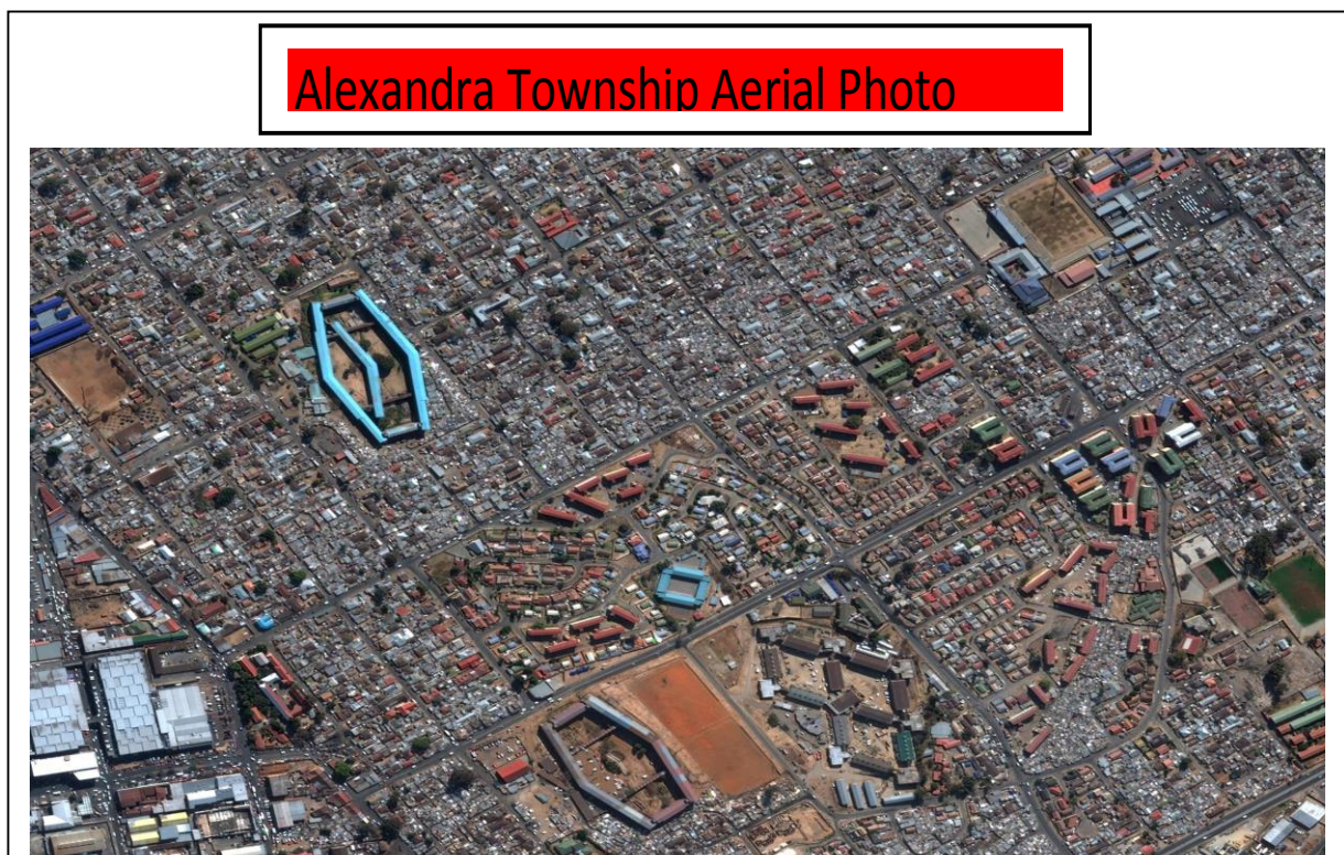
Figure 2.2: Aerial photograph of part of Alexandra Township settlement in Johannesburg www.alexandratownshipaerialphotograph (accessed on 2014.04.21)