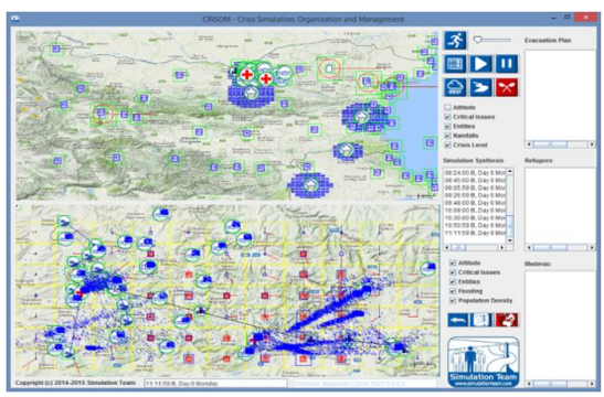
Figure 3: rain propagation in ST_CRISOM

for improving communications with citizens and building consensus (Rossetti et al.2013).