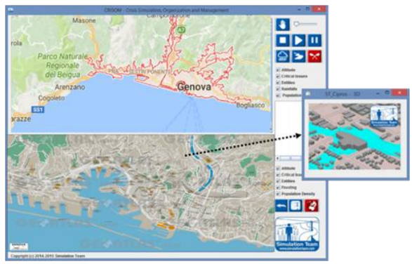
Figure 2:ST CRISOM User Interface

Therefore popular & unpopular decisions influence statistically the average consensus and in some case, extreme situations, could lead also to the risk of delegitimization of current governance bringing unexpected early elections. (Rimlinger 1971).