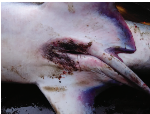
FIGURE 1. Cloaca of Alopias pelagicus showing parasite infestation

The parasites were found clustered around the cloacal aperture of the pelagic thresher shark and were of upstream orientation (Figure 1). Small wounds were found in the area when parasites were detached. Fifteen sharks were observed, out of which eight were found to be infested with parasites. The pre-caudal length (PCL) of the sharks ranged from 103 to 139 cm and weight from 30 to 55 kg. In total, 36 parasites were collected. All the collected parasite specimens were females of length range 10.8 to 16.7 mm total length (TL). Many parasites were lost before collection due to struggling of fish, handling of large fish, washing of deck to clear the deck from slime etc. The sharks were attended after clearing all the fishes mainly tunas and debris from the deck.