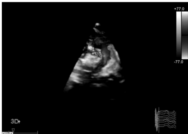
FIGURE 1. 3DE color flow acquisition from the suprasternal long-axis showing left aortic arch flow