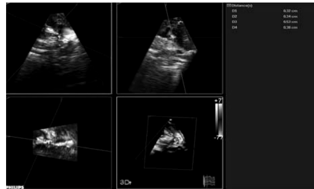
FIGURE 2. By using MPR mode: Right upper sector (sagittal view which measurement end pulmonary end PDA is taken), left upper sector showing PDA end pulmonary in ovule shape