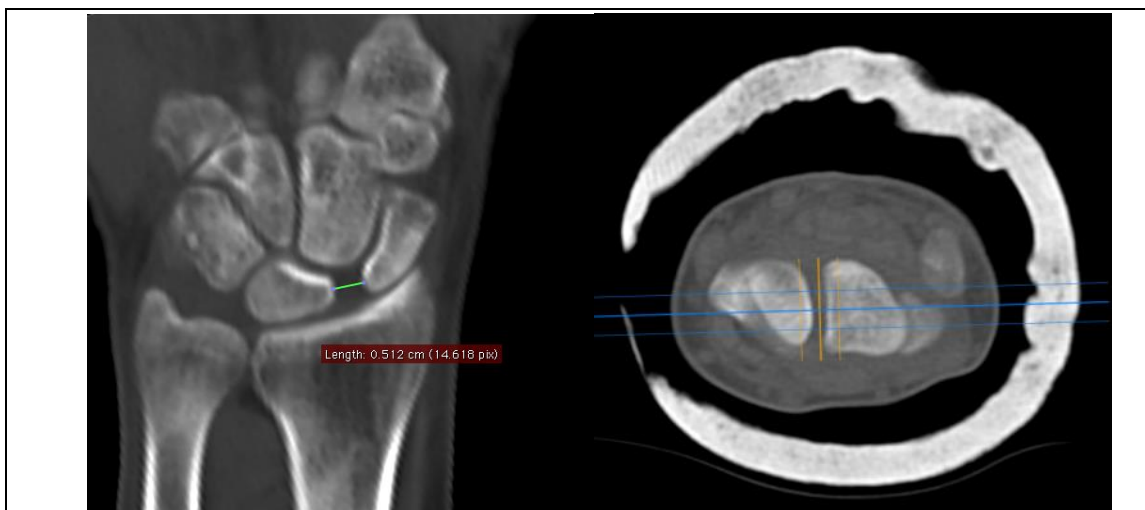
Fig. (1). Measurement of the scapholunate interval in the coronal plane

After ethics committee approval, we retrospectively evaluated all distal radius fractures ( n=391 ) from 2007 to 2015 that were treated in the British Hospital of Montevideo, Uruguay. These were identified through an ongoing procedure database kept by the traumatology department, that collects patient and treatment data prospectively. Patients with a non-anatomic fracture position were operatively treated using a volar approach with volar variable angle plate. The scapholunate joint was not surgically treated in any patient. All patients underwent a postoperative Computer Tomography (CT) scan. We excluded one patient with a bilateral distal radius fracture that had a SLD of one of the fractured sides. Patients ( n=14 ) with a scapholunate interval (SLI) of \geq 3\text{mm} in the injured wrist underwent a CT scan of the contralateral wrist. Of these patients 8 (57%) had a contralateral SLI that was \geq 3\text{mm} . We included 2 males and 4 females, with a median age of 61 (54-87) years with an average radiographic follow-up of 109\pm 91 weeks and average functional follow-up of 136\pm 90 weeks. One patient had a conventional radiograph at final follow-up, all other patients had a CT scan. There were 3 type C3 fractures, 1 type C1 fracture, 1 type B2 fracture and 1 type A2 fracture. There was an associated ulna fracture in 2 patients.