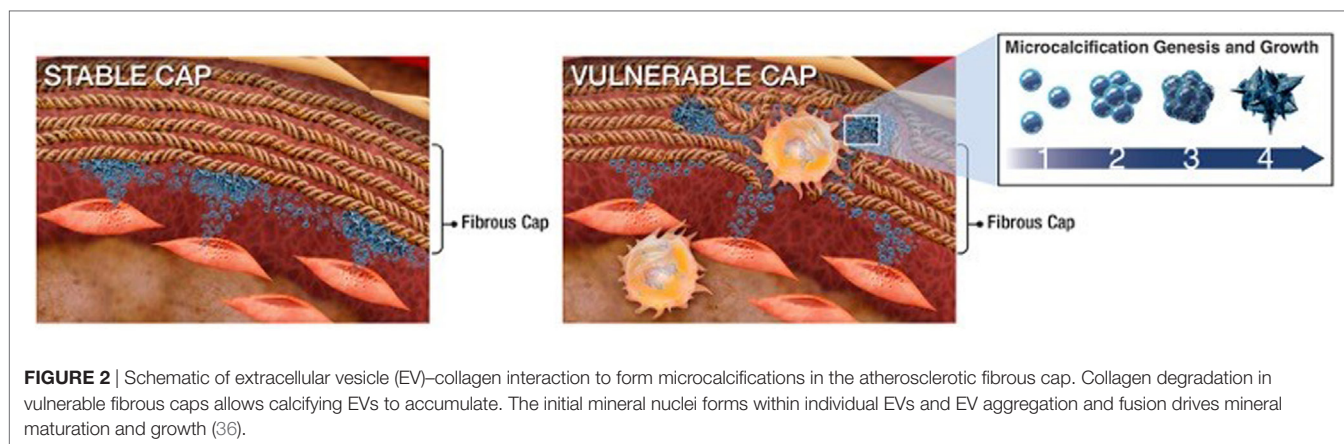
FIGURE 2 | Schematic of extracellular vesicle (EV)–collagen interaction to form microcalcifications in the atherosclerotic fibrous cap. Collagen degradation in vulnerable fibrous caps allows calcifying EVs to accumulate. The initial mineral nuclei forms within individual EVs and EV aggregation and fusion drives mineral maturation and growth (36).

(DDR-1), a collagen receptor, regulates SMC phenotype by sensing extracellular collagen. DDR-1-depleted SMCs exhibit elevated collagen production, EV release, and mineral deposition. DDR-1 functions as a regulator of TGF- \beta signaling pathways, acting as a switch between pro-fibrocalcific and anti-fibrocalcific TGF- \beta signaling (54). Therapeutic strategies to control these pathways and prevent or reverse SMC-driven calcification will require a better understanding of the mechanisms that lead to their formation within the cell, nucleation of mineral outside the cell, and the role of the ECM in calcification propagation. SMC-derived EVs are the most studied type of calcifying EVs in cardiovascular tissues and the mechanisms identified in these cells may help inform research into other cellular drivers of cardiovascular calcification.