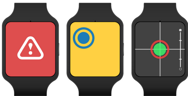
Fig. 1 Modes indicating different states (from left to right): tool outside of tracking range, tool far away from insertion point, tool in close enough distance to insertion point

In targeting mode, the crosshair is not displayed, as the small distance shown on the display might be misleading and different scaling factors are used on the real needle distance to display the circle representing the needle within the bounds of the small display. Thus, the relative direction with respect to the display center is preserved but not the distance. The user is guided toward the correct location by bringing the