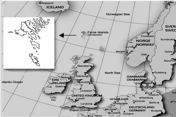
Figure 1. The position of the Faroe Islands