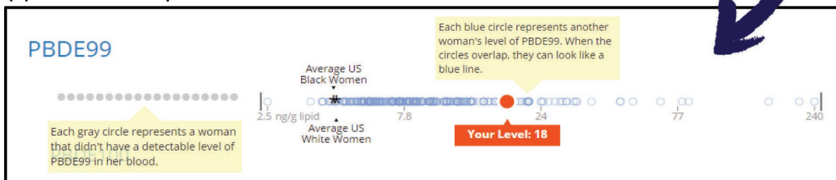
Figure 1. (A) During a typical user experience, participants first see their notable exposure results (headlines) on the Summary page. (B) Clicking on a chemical name takes them to more information about that chemical group, including exposure sources, health effects, options for taking action, and complete results. Chemical pages include personalized graphs that depict a participant’s chemical level in the context of the study distribution. (C) Digital features like explanatory pop-ups help people interpret the information-rich plots. (D) Participants can find more tips for reducing their exposure in the “What You Can Do” section. Other sections of the report include “Health Concerns” and “Overall Study Results” (not shown). To view an example web-based Digital Exposure Report-Back Interface (DERBI) report, see http://silent.spring.org/research-area/digital-exposure-report-back-interface-derbi (Silent Spring Institute 2016).