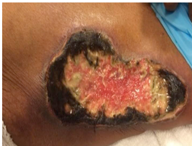
Figure 1 A representative image showing an ulcerated calciophylaxis lesion with black eschar in a peritoneal dialysis patient.

As summarized in Table 2, PD patients who developed calciophylaxis were more likely to be female (71% vs 30%, P=0.032 ) and had higher frequencies of obesity (57% vs 20%, P=0.031 ), prior history of being on HD (71% vs 30%, P=0.032 ), prior episodes of recurrent hypotension (43% vs 7%, P=0.004 ), and warfarin therapy exposure (71% vs 16%, P=0.001 ). Review of echocardiographic data from calciophylaxis PD patients with recurrent episodes of hypotension showed that all of these patients had symmetric left ventricular hypertrophy and reduced left ventricular ejection fraction (range: 20–32%). Calciophylaxis patients had