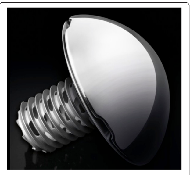
Fig. 3 The Arthrex Eclipse Prosthesis (Arthrex, Naples, USA) (Figure provided by the manufacturer)

central cage unit is inserted over a collar-bearing baseplate (trunnion) for metaphyseal fixation. The trunnion covers the resection plane at the anatomical neck, and joins cortical support. The third component is a corresponding humeral head. In contrast to the other described implants, the Arthrex Eclipse is the only available stemless system that offers screw-in insertion.