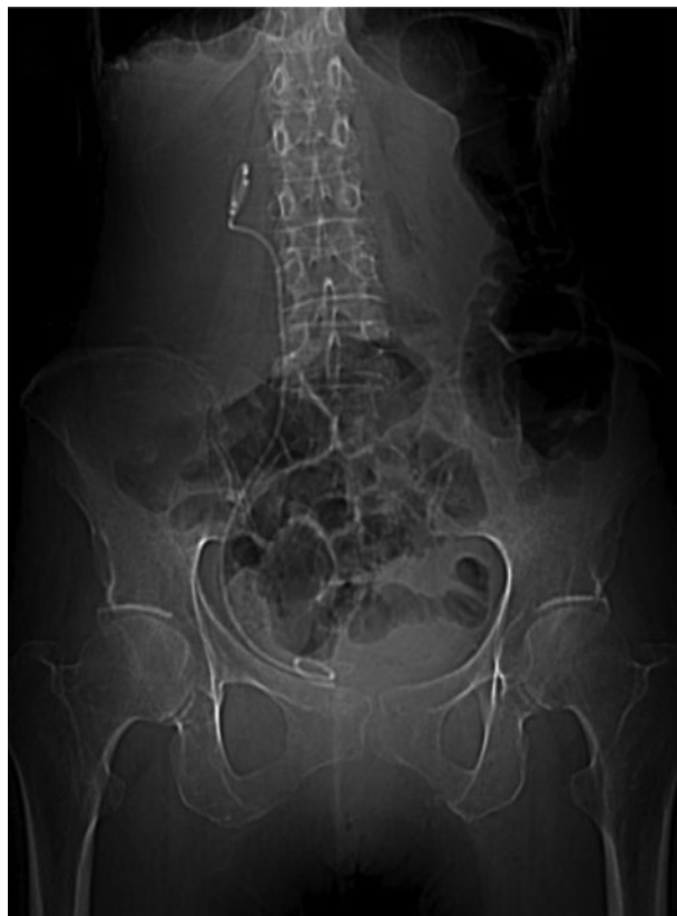
FIG. 3. Plain abdominal radiograph demonstrating a right ureteral stent in proper position and a straightened ureter.

Serum electrolytes were normal, and the estimated glomerular filtration rate was >60 mL/minute. A CT scan demonstrated hydronephrosis extending from the portion of the ureter