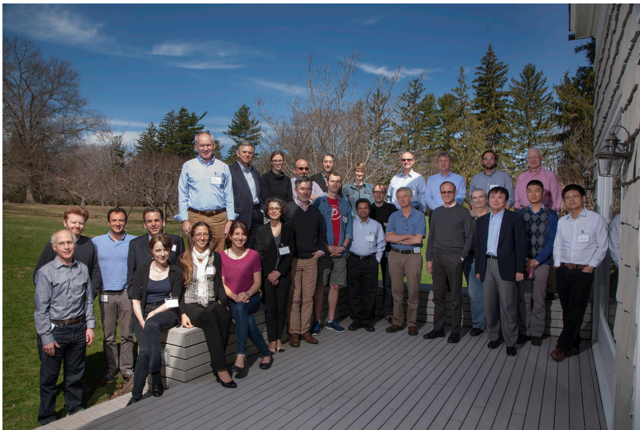
Figure 2. Banbury Meeting Attendees

for naive human pluripotency, ultimately yielding an improved combination of five kinase inhibitors (5i/L/FA) that induces and maintains OCT4 distal enhancer activity when applied directly to conventional hESCs (Theunissen et al., 2014). Using these optimized conditions, his group demonstrated direct conversion of primed to naive ESCs in the absence of transgenes and isolation of novel hESCs from human blastocysts. They noted, however, that naive hESCs showed upregulated XIST and evidence of X inactivation, raising the possibility that X inactivation in naive stem cells in mouse and human may be different. Critically, transplantation of GFP-positive human naive hESCs into mouse blastocysts yielded no GFP-positive E10.5 embryos, either by their original method ( n = 860 embryos) or by published methods (Gafni et al., 2013) ( n = 436+ embryos). PCR for human mitochondria is a more sensitive assay, identifying even the presence of 1/10,000 human cells, but this also failed to detect mouse-human chimerism. Although the generation of interspecies chimeras by injection of human ESCs into mouse morulae was proposed as a stringent assay for naive human pluripotency (Gafni et al., 2013), the assay may be too inefficient for use as a routine