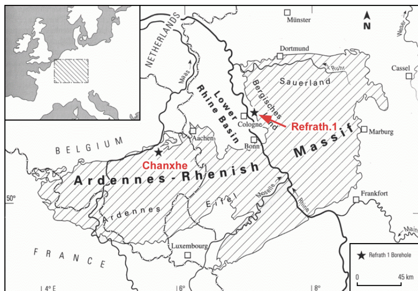
Figure 1: The Ardennes-Rhenish Massif and the location of the reference section and borehole, respectively in a neritic (Chanxhe) and a pelagic (Refrath 1) facies.

FRÖDER & STREEL, 1994; HARTKOPF-FRÖDER, 2004). The sedimentary rocks of the Refrath 1 borehole are mainly dark grey, partly calcareous mudstones; rare marlstone intercalations are considered to be fine-grained turbidites. Both contain many fossils. Aside from the very well preserved miospores of the Retispora lepidophyta - Knoxisporites literatus (LL) miospore Zone, numerous other microfossils are known i.e. conodonts (PIECHA, 2004) and entomozocean ostracodes (GROOS-UFFENORDE, 2004). Some characteristic ammonoid species are present in the lowermost part of the borehole (KORN, 2004).