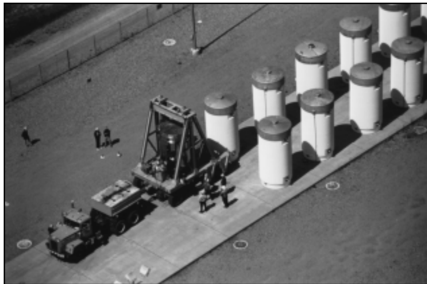
Figure 2.2: Concrete storage casks at a U.S. nuclear power plant

In a cask system, a flat concrete pad is provided (either outdoors or within a building), and large casks that contain the spent fuel can be added as needed to store the amount of fuel required. The casks provide both shielding and containment. The initial cost of establishing the facility is small, and the operating costs once the fuel is loaded are also small, but the capital cost of the casks themselves is significant; as each cask costs roughly the same amount as previous casks, there are few economies of scale in storing more fuel. For an at-reactor facility, the fuel can typically be moved from the pool to a dry cask using primarily fuel handling equipment already available at the reactor site. A wide variety of specific cask designs are available from several manufacturers, including both metal and concrete casks (the latter typically having metal inner liners). 12 Originally, like vaults and silos, casks were designed only for storage (so-called “single purpose” casks). More recently, some cask designs have been