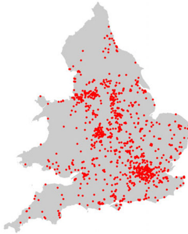
Figure 1. Location of families in the E-Risk study who were living in England and Wales and participated in Phase 12 assessment ( n = 1,071 )