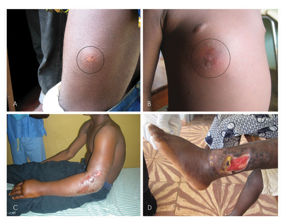
Fig 1. Clinical forms of Buruli ulcer showing a nodule (A), plaque (B), edema (C) and ulcer (D).