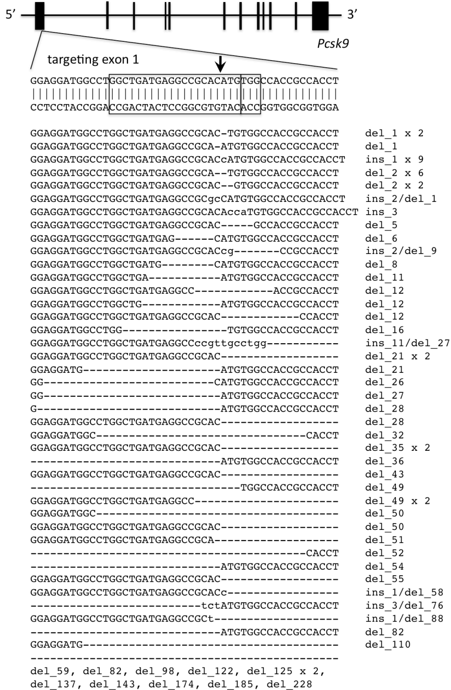
Supplemental Figure 1. Mutagenesis of Pcsk9 in vivo with CRISPR-Cas9. The CRISPR-Cas9 target site in Pcsk9 exon 1 is shown. The boxes indicate the 20-bp sequence matching the protospacer and the 3-bp PAM. The predicted site of Cas9-induced double-strand breaks is indicated with an arrow. Deletions and insertions detected by PCR amplification and Sanger sequencing of the on-target site in liver genomic DNA from a representative mouse (“C” in Figure 1) that received an adenovirus expressing Cas9 and the guide RNA for the target site (CRISPR- Pcsk9 ) are shown. At the bottom are deletions that spanned the entire site.