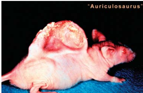
Fig. 1 Photograph of infamous mouse with the human ear, depicting new tissue-engineered cartilage generated in the shape of a human ear (C. A. Vacanti. Ref. [1]).

a means to provide material for medical research is by far not a new phenomenon. The German pathologist Rudolf Virchow [58] for instance initiated the first known repository in 1847. He eventually amassed more than 23,000 human tissue specimens. Ever since that time a large number of (mainly pathology or dermatology) departments in academic medical institutions and hospitals around the world is housing temporary or permanent collections of preserved human tissues and or organs. In his ground-breaking book 'Die Cellularpathologie in ihrer Begründung auf physiologische und pathologische Gewebelehre...' ('Cellular Pathology in its foundation on physiological and pathological tissue science') (see Fig. 1), published in 1858, he set a cornerstone of modern medicine and biology based upon physiological and pathological histology with his postulate: ' omnis celula e(x) cellula ' ('Every cell is derived only from a preexisting cell'). He originated the idea that each cell in each living organism, both plant and animal, originates from another cell and that the origin of disease can only be located in the cell.