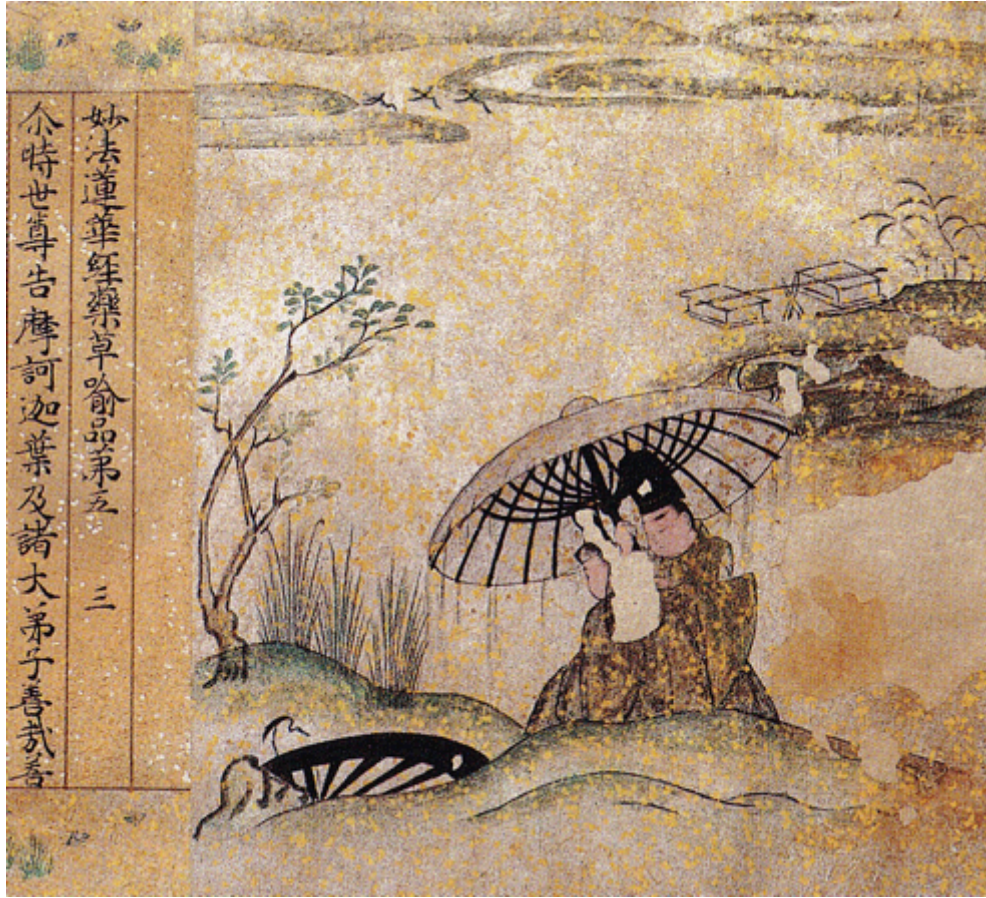
Figure 3. Kunōjikyō: “Parable of the Medicinal Herbs” (Yakusōyubon, chapter 5) frontispiece. 1145. Tesshūji Collection, Shizuoka Prefecture.

The central importance of the offering’s medium is rhetorically underlined by the locution “phantom spectre of her work” ( kano seisaku no yūkon かの製作の幽魂) in Kaga’s dedication. This phrase, which echoes “the revenant spirit of her work” ( kano seisaku no bōrei かの製作の亡霊) in the previous paragraph, implies that it is the phantom of the work, rather than that of the author, that is the underlying cause for the damnation of both Shikibu and her readers: their karma are mutually implicated through the medium of the work, which attains to the significance of a medium in the occult sense, as a means for communicating with the spirits of the dead. Thus, in Kaga’s offering, the redemption of the author and her readers of the Genji is entirely dependent on the