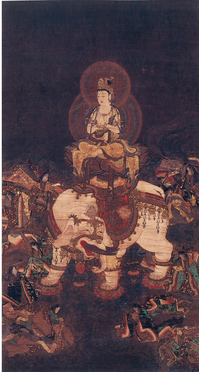
Figure 1. Fugen Bodhisattva with Ten Rākṣasīs in Japanese-Style Dress.