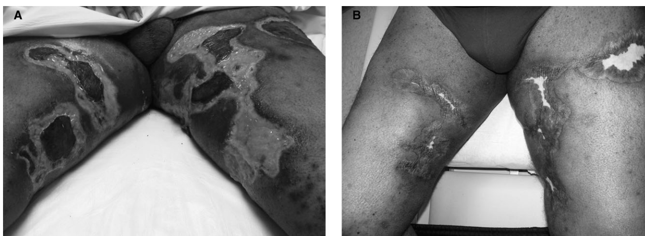
Fig. 1. (a) Proximal calciphylaxis: bilateral inner thighs (while on cinacalcet). (b) Resolving calciphylaxis: 8 weeks after stopping cinacalcet and following sub-total parathyroidectomy.