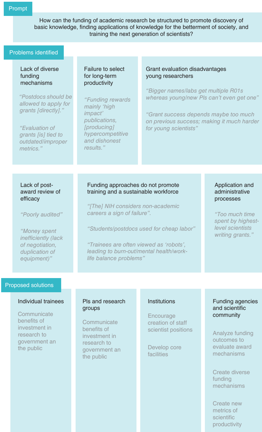
Chart 3. Summary of the outcomes of the funding workshop. Overall, we would characterize the output of this workshop as a call by young researchers for an increase in the efficiency and reproducibility of science by developing new measures of the quality

of research output and of individual researchers' productivity, and incorporating these criteria into the approval of grants. Participants seemed to agree that this approach, along with some of the other recommendations indicated, would more adequately reflect