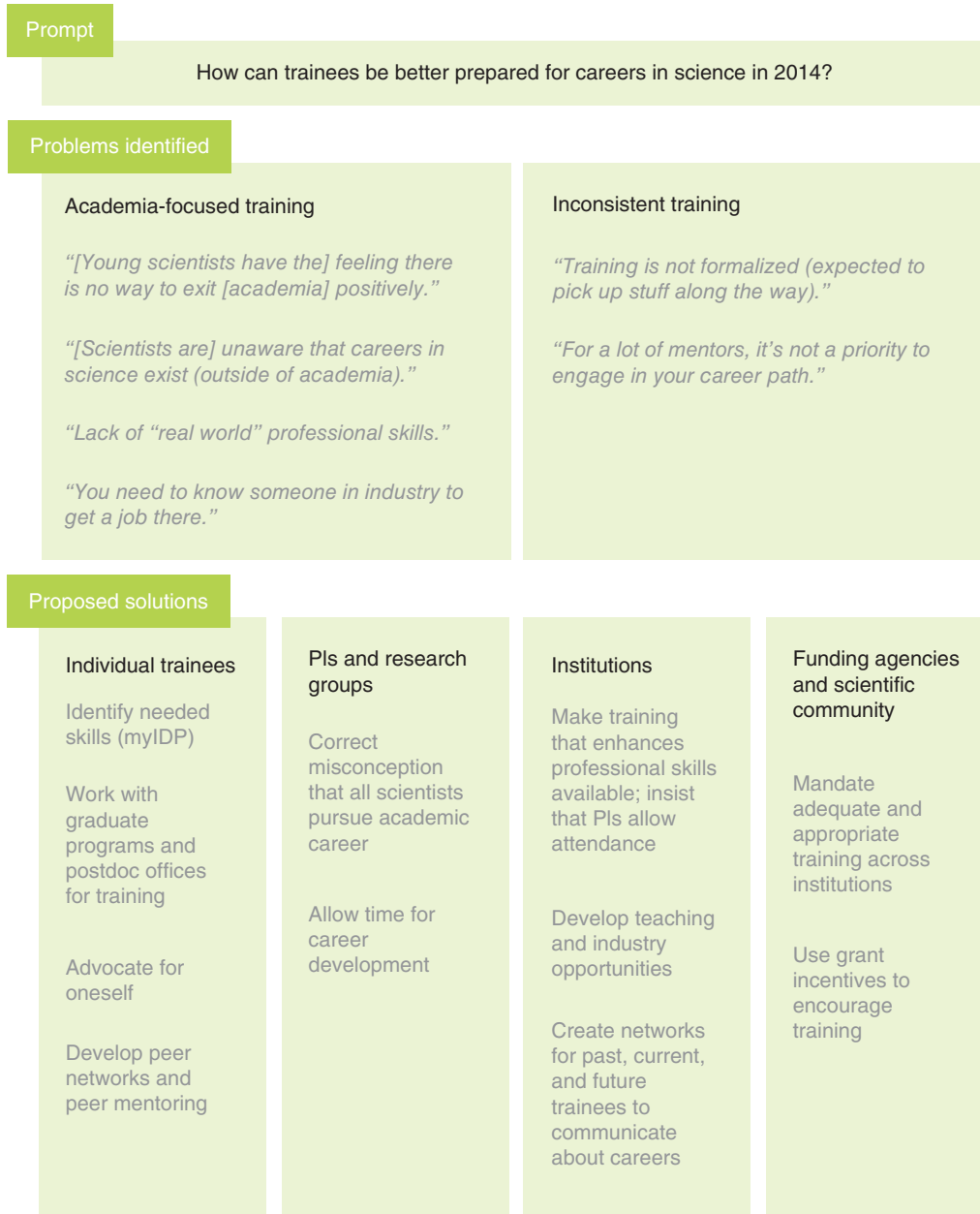
Chart 1. Summary of the outcomes of the training workshop

The outcome of this workshop highlighted that the current culture of training places heavy emphasis on research and publications, leaving little time for "soft skill" or career development. Postdoctoral "training" is a misnomer: as one participant put it,