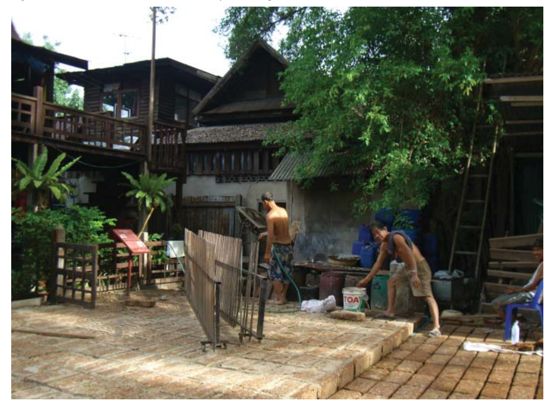
Journal of the Siam Society, Vol. 100, 2012