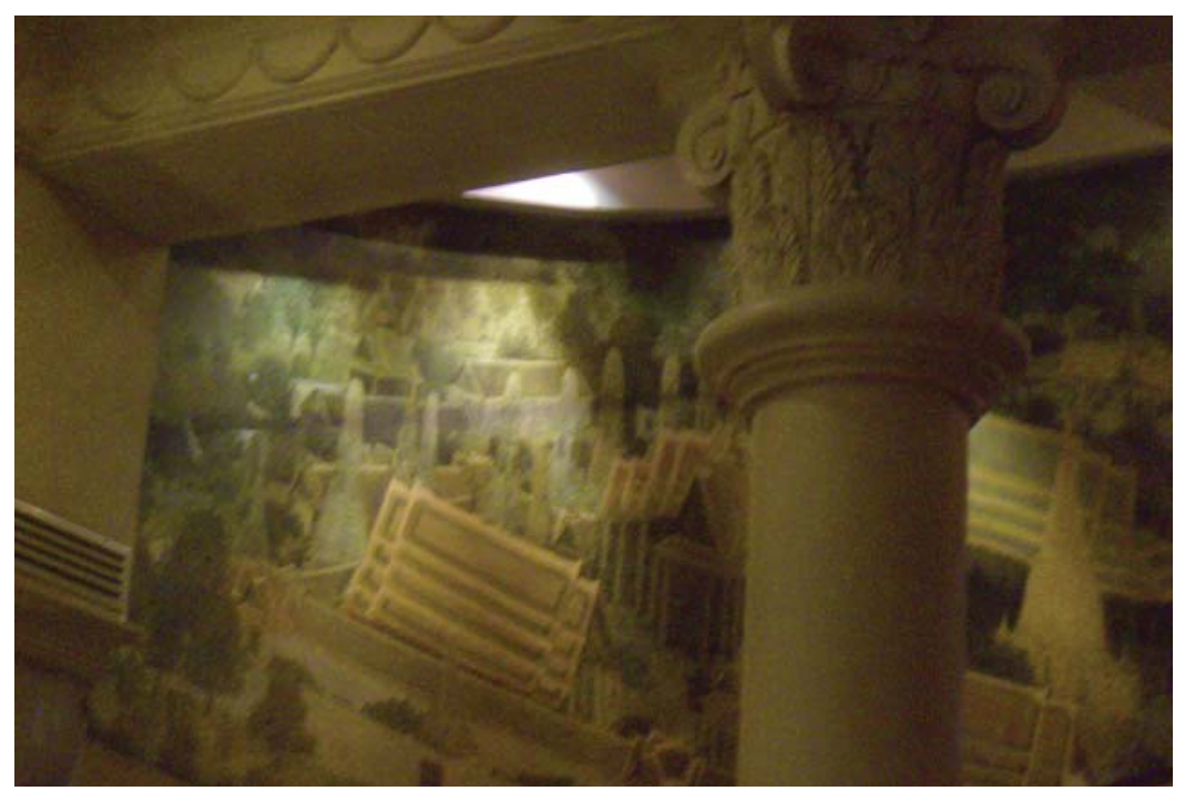
Figure 6. A meeting of two crypto-colonies: "Greek columns" and the Siamese city

The Corinthian capitals that grace the interior of the Rattanakosin Hotel in combination with murals depicting temples and palaces of clearly and aggressively Siamese design (Figure 6) offer a striking illustration of this mixture, in close association with the royal name (the hotel is called "Royal Hotel" in English) and a location in the heart of Rattanakosin Island, just where Ratchadamnoen Avenue