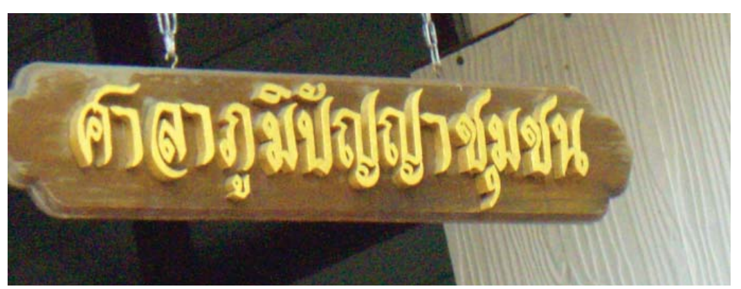
Figure 5. The Pavilion of the Community's Local Knowledge

formal red shingle with gold lettering that read "pavilion of the community's local knowledge" ( saalaa phumipanyaa chumchon ) (Figure 4). Local acquiescence in this officializing discourse (Bourdieu 1977:40) does not automatically mean conformity with its semantics, but it does entail a risk of cooptation. One should ask how far even the well-intentioned recognition of local knowledge might represent a successful imposition, however strongly resisted from within, of an interpretative framing that reproduces the hierarchical colonization of knowledge that has been analyzed in many colonial and postcolonial settings (e.g., Gupta 1998; Raheja 1996).