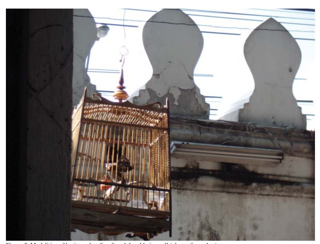
Figure 3. Modalities of heritage: handicraft and the old city wall (photo: the author) Figure 4. Spiritual symbiosis: a new home for the spirits, and old home for the living (photo: the author)