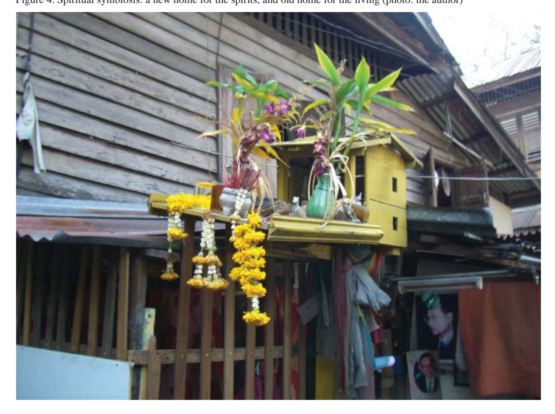
Journal of the Siam Society, Vol. 100, 2012