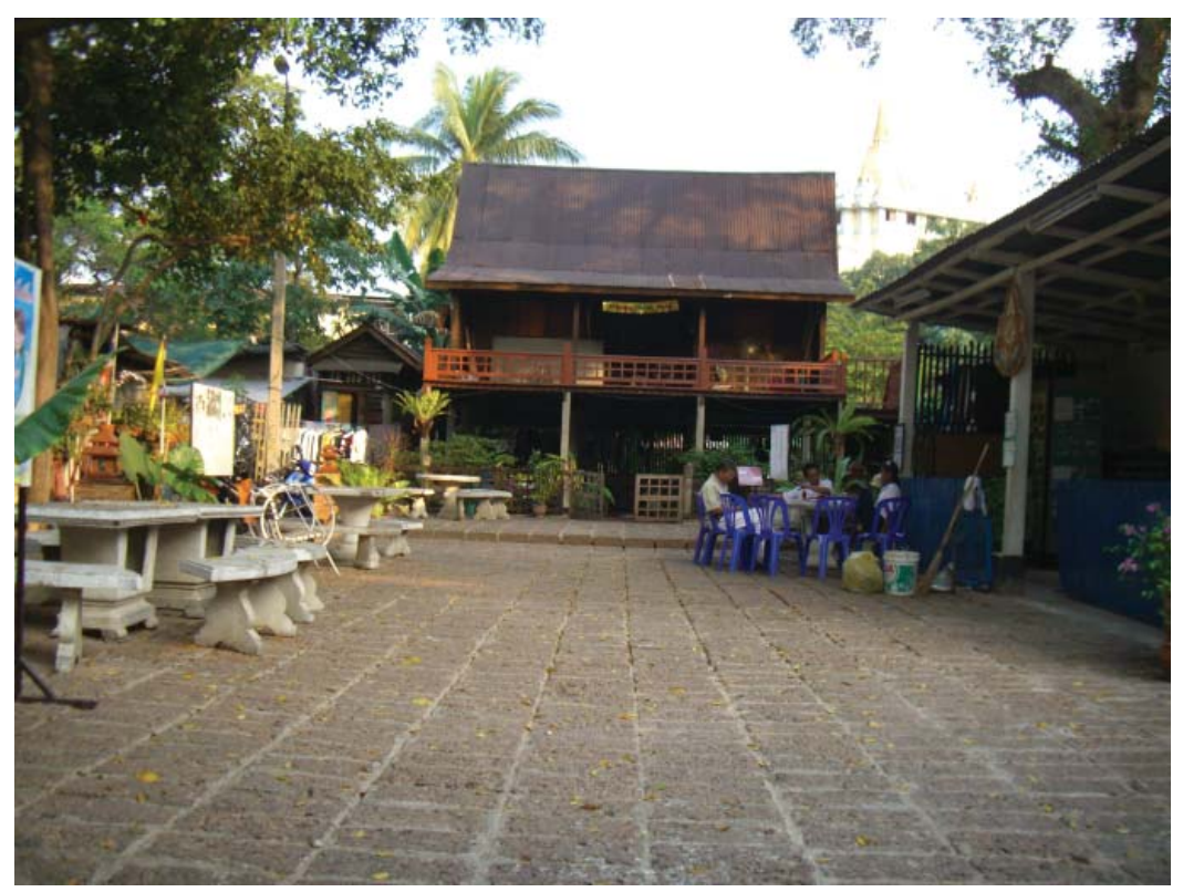
Figure\ 1.\ Pom\ Mahakan:\ A\ venerable\ house\ overlooking\ the\ community's\ meeting\ space\ (photo:\ the\ author)