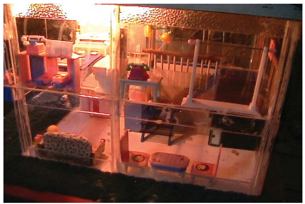
Figure 8. Modernist dreams of the future: a model house at Pom Mahakan

In Pom Mahakan, for example, there has been a great deal of discussion (from 2004 on) about what kinds of house would replace the slum dwellings if and when the residents dared to attempt that transformation. While there was some sentiment in favor of row houses, a design familiar from the Chinese-inspired shophouses of other parts of Rattanakosin Island, the interiors were to be furnished in largely