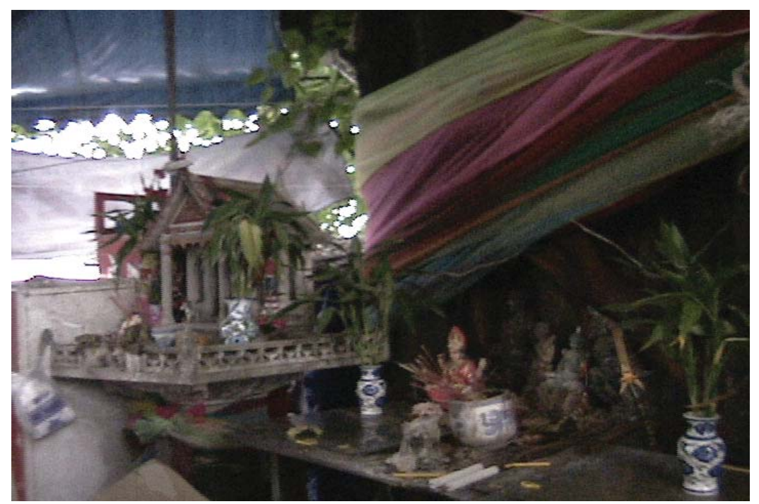
Figure 7. Ancestral presence, threatened future

the irrelevance of the material, but on the grounds of the presumed incapacity of such humble objects to contribute to the highly material streamlining of the image of Thai culture (see Byrne 2009: 84). To the residents, by contrast, such moves are simply sacrilegious, and an attack on their standing as a representative fraction of the Thai nation. In the same way, the rabop of municipal administration transcends the alleged iniquities of those who staff the institutional framework, permitting popular judgment on their performance even though such judgments rarely translate into